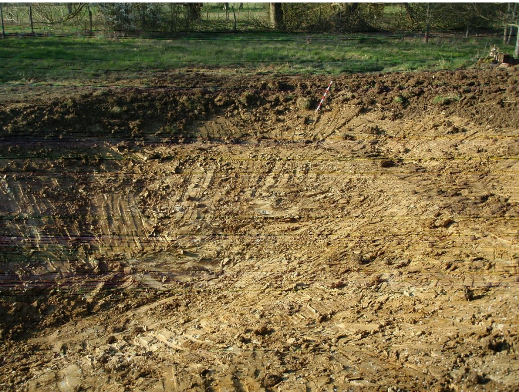
Plate 6. Ground reduction for pond