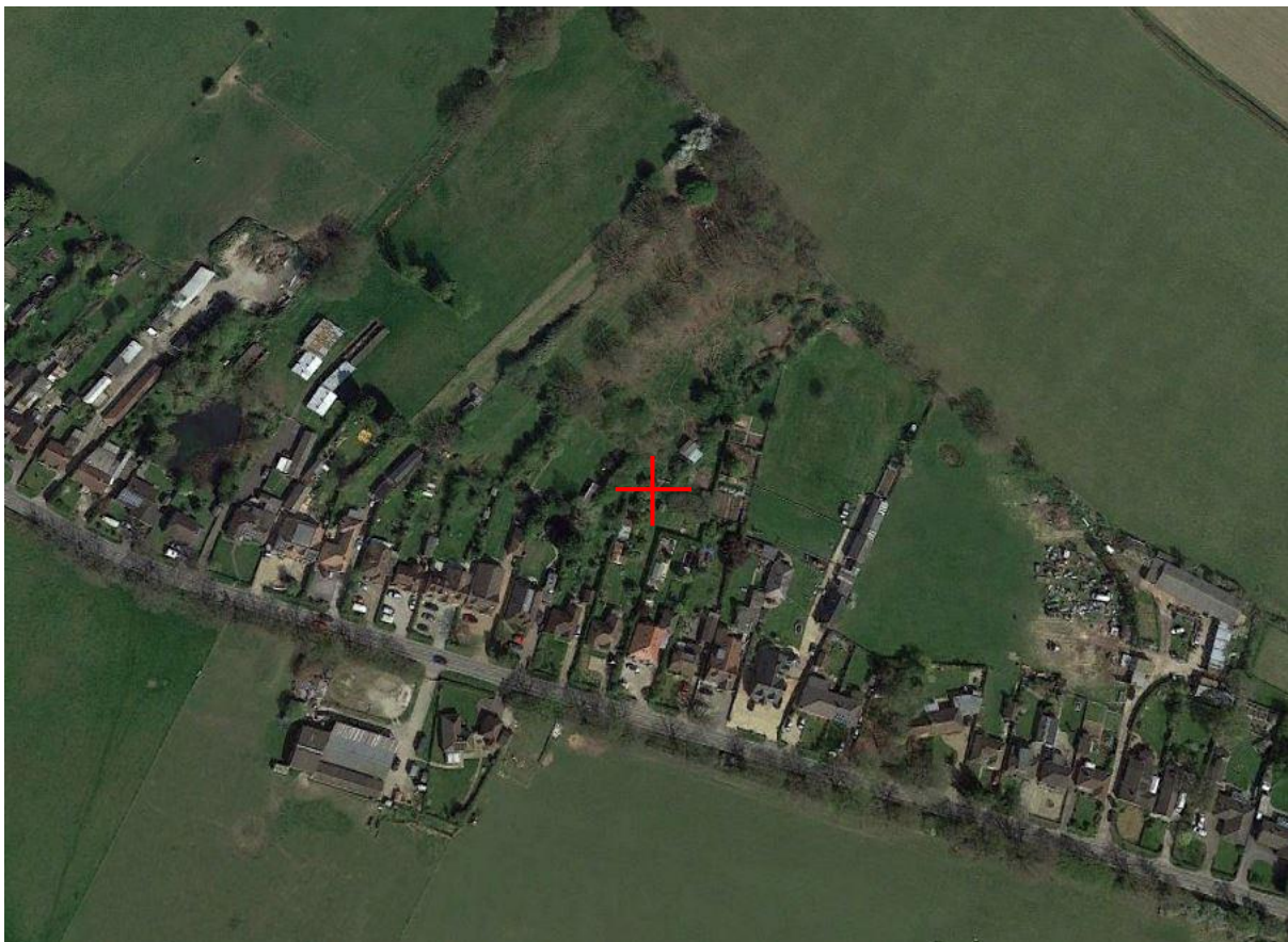
AP 1. Aerial view of site (red target) showing the site before development.