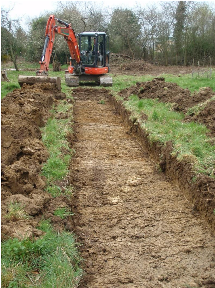
Plate 3. Topsoil strip