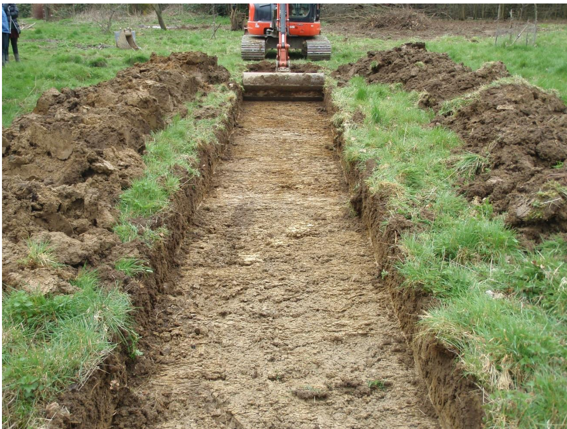
Plate 2. Topsoil strip