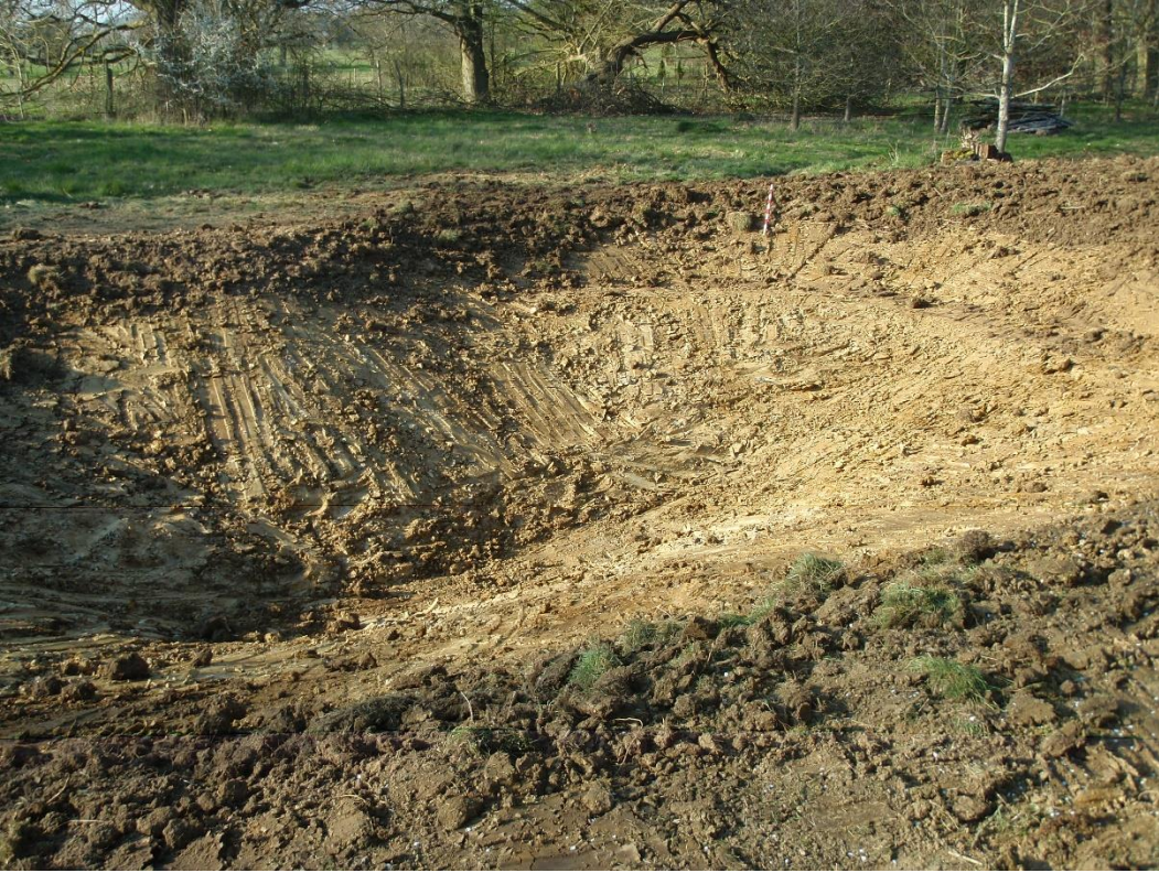
Plate 5. Ground reduction for pond