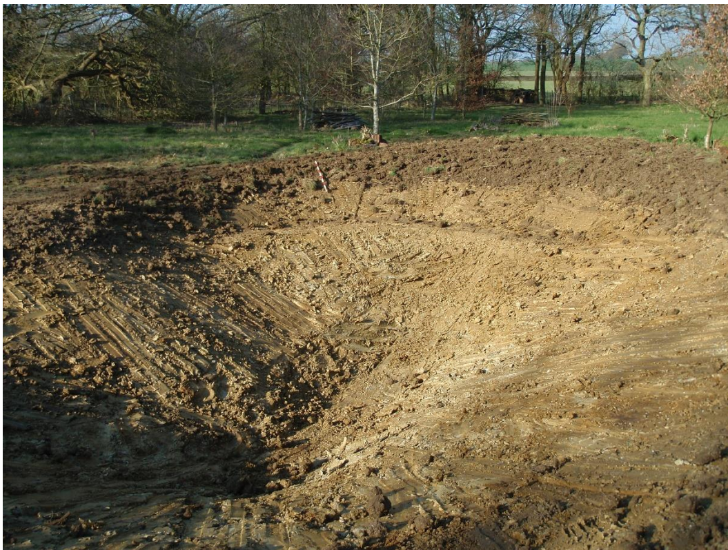
Plate 4. Ground reduction for pond