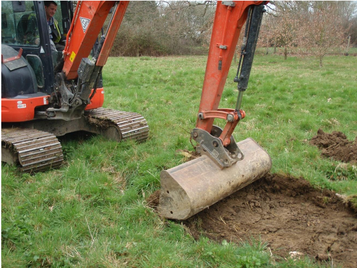
Plate 1. Topsoil strip